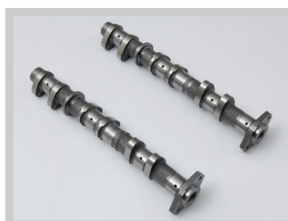
A9618055 Camshaft Inlet Kit and A9618056 Camshaft Exhaust Kit