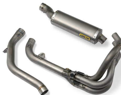
A9600197 Exhaust System Arrow Stage 2 Offers significant power gains when used in conjunction with the Race ECU Kit