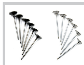
A9618061 Valve Kit