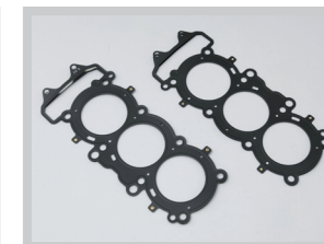
A9618072 & A9618073 Cylinder Head Gasket Kits

For further information please refer to the Race Kit Manual, which can be accessed via the Race Kit Heading, within the Racing section of www.triumph.co.uk