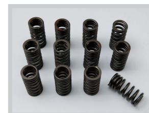
A9618058 Valve Spring Kit