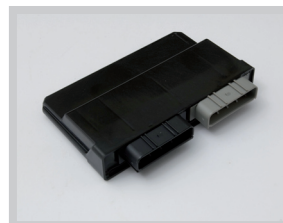
A9618070 Race ECU Kit