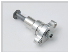
A9618060 Cam Chain Tensioner Kit