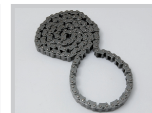
A9618059 Cam Chain Kit